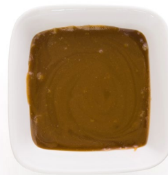
Vanilla Caramel Sauce